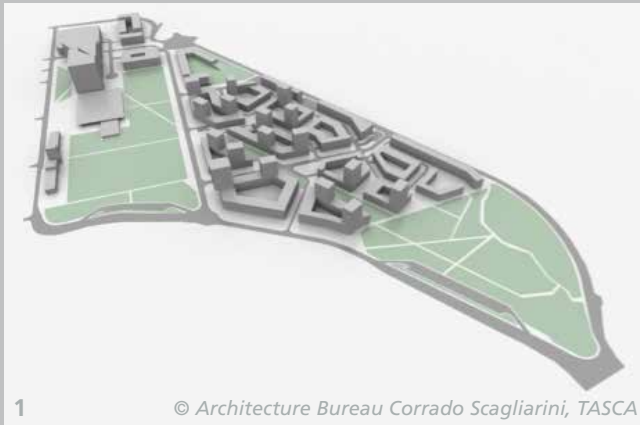
© Architecture Bureau Corrado Scagliarini, TASCA