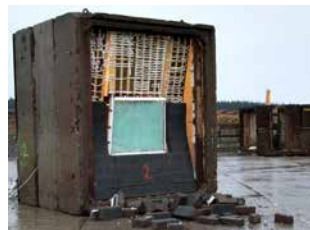
Fig. 9: Experimental full-scale investigation of the TecDur® BlastWall protection system. Left: Internal view during the test. Right: External view after the test.