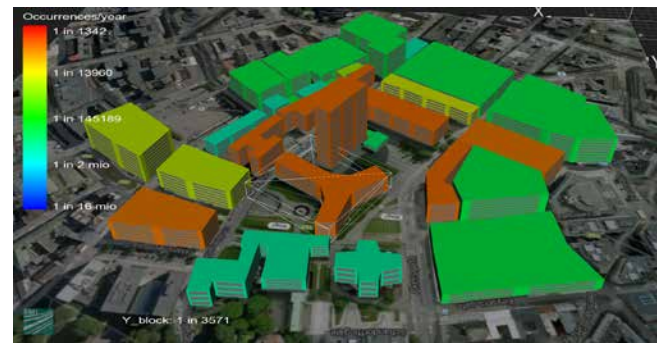
Fig. 3: Empirical frequency of hazardous events in dependency of the building usage in an urban area.

A hands-on access to security relevant knowledge is supported by links to the conceptual planning tools SecuRbAn and Securipedia ( www.securipedia.eu ).